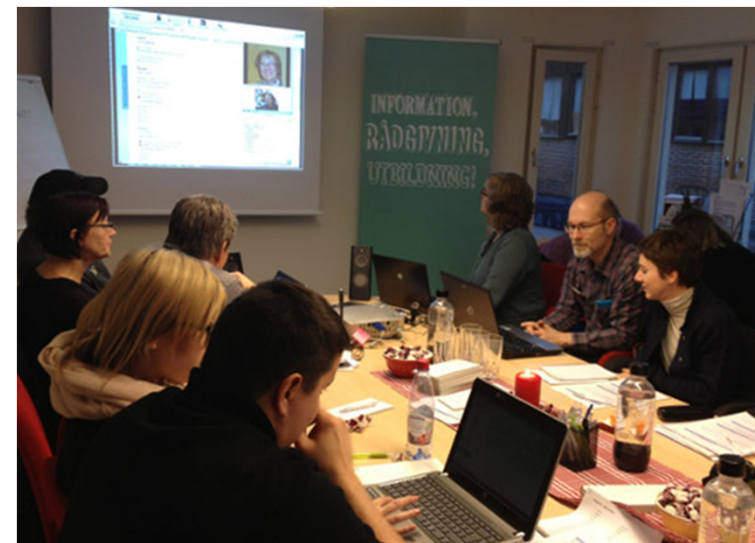
Picture from project meeting in Falköping, Sweden. The testing of the learning material in Moodle was partly led via an iLinc internet connection with project personnel located in Tornio, Finland.